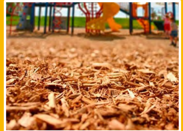
Engineered Wood Fiber