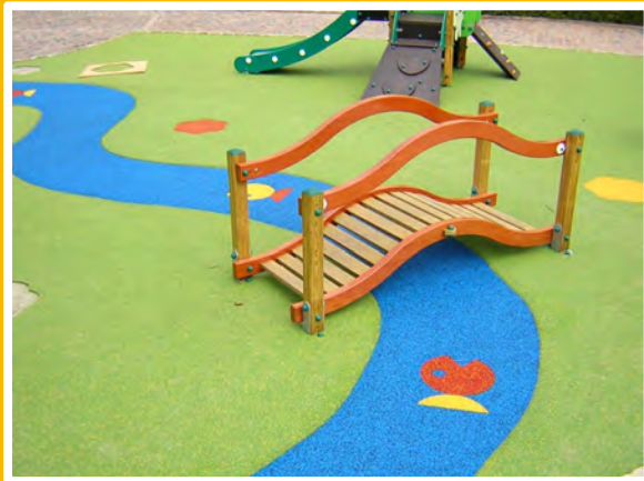
Poured-in-Place Rubber Surface